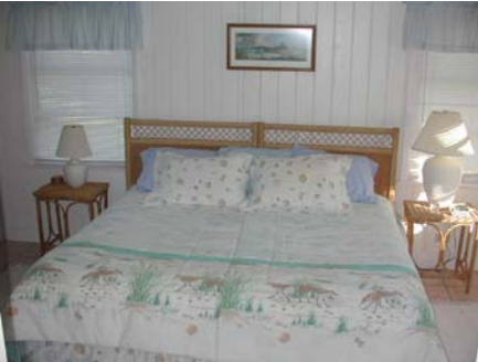
Tahiti Cottage Bedroom with King Bed