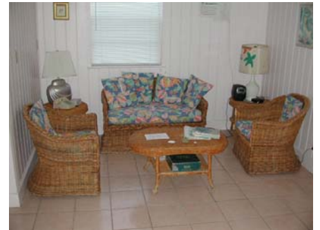
Tahiti Cottage - Living Room