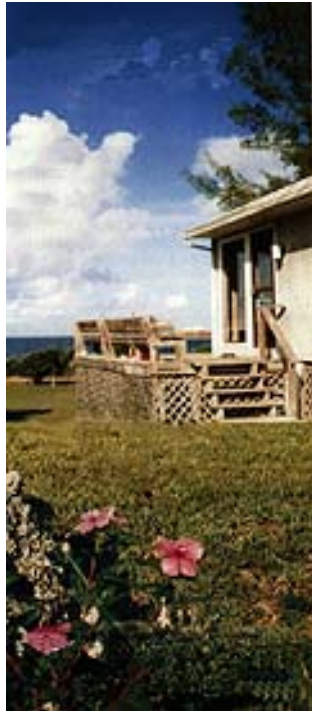
Jamaica Cottage overlooking Atlantic Ocean