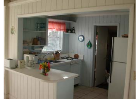
Bali Hi Kitchen