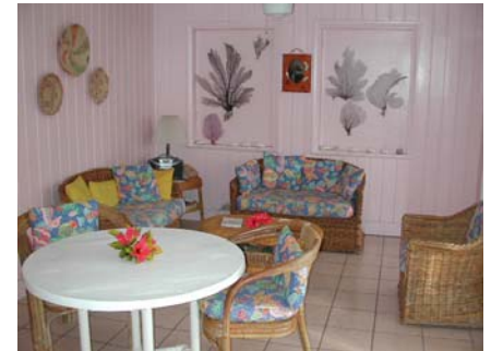
Pink Cottage - Living Area