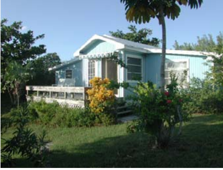
Bali Hi Cottage