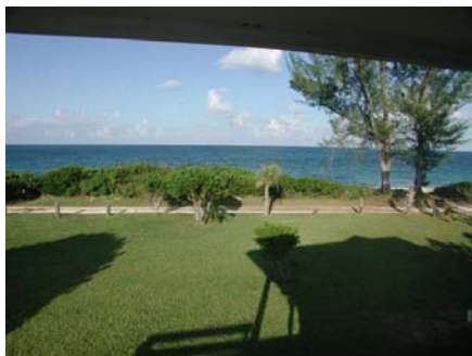
View of Atlantic from Jamaica Cottage