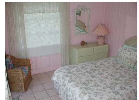
Pink Cottage - Master Bedroom