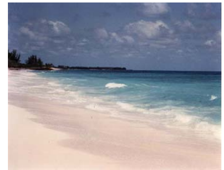
Spectacular Atlantic Ocean beaches